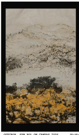
OUTCROP SYN POL ON CANVAS 2006 200 x 100 cm

Some places are still available in Brett's workshop.