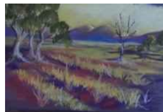
Pastel Paintings from the Gail Tavener Workshop