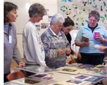
Inspiration in the Gail Tavener Workshop

All members are invited to the monthly general meetings which are held at the Canberra Bowling Club, Hobart Avenue, Forrest. From June 25, the commencement time will change to 7.00 pm. The library is open during the meeting, a light supper is served and there is a door prize. Entry fee is $2.