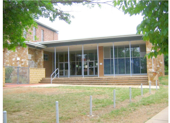
Entrance to the Wesley Centre

Entry forms for the Spring Exhibition and the Molonglo Catchment Prize will be sent out at the beginning of August with the August/September Newsletter. I hope you are already thinking about entering our exhibition, especially if you have not done so before.