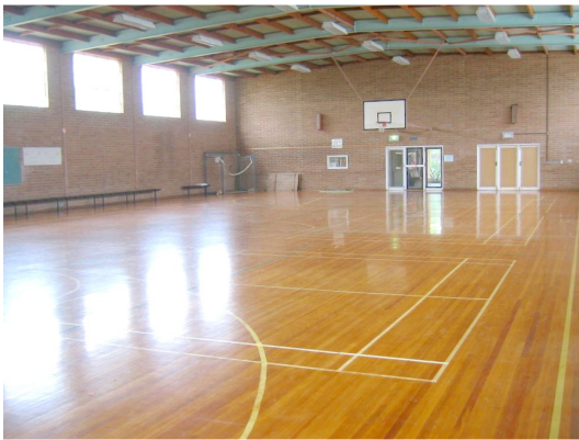
Spacious interior of the Wesley Centre