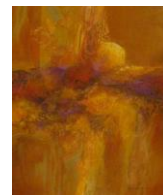
Abstract/Contemporary Highly Commended, Land of Legends, By Val Fitzpatrick