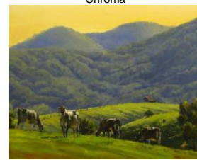
Landscape Highly Commended, Bottom of the Brown By Nicki Hall