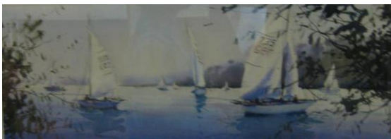
Sport & Children at Play First Prize, Sailing Competition, Sponsored by Brumbies Sport & Social Club

Finally, a huge thank you to all the sponsors for supporting ASOC and its members through sponsorship of prizes.